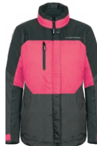
189124 8RO Rose Red - XS to 2XL