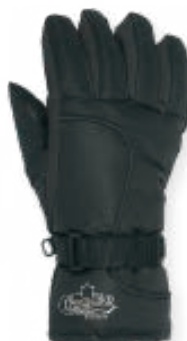
BLACK # 00