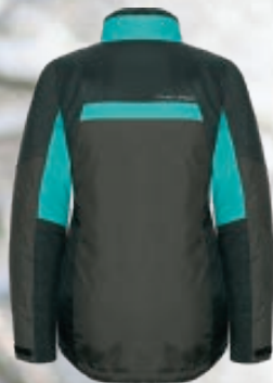
189124 500 Lake Green - XS to 2XL