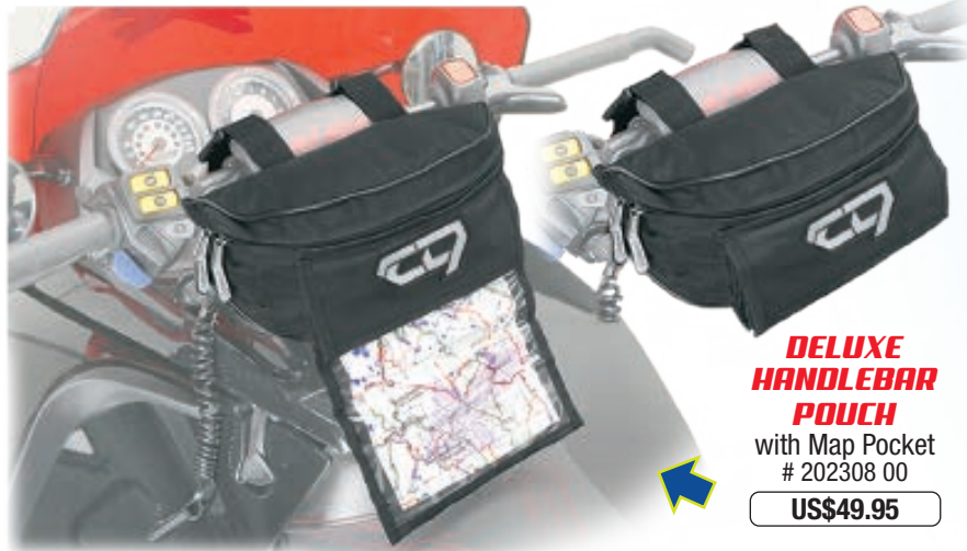
DELUXE HANDLEBAR POUCH with Map Pocket # 202308 00 US$49.95