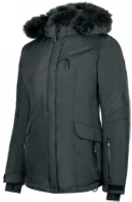
187123 000 Black - XS to 4XL 187123 T00 Black Bengaline - XS to 3XL