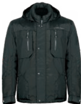
195123 000 Black - S to 3XL