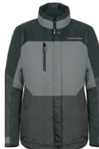
189124 900 Grey - XS to 2XL