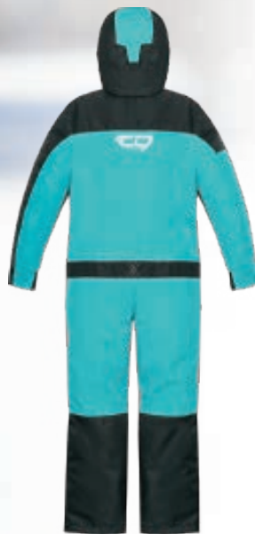
120723 500 Lake Green 6 to 18