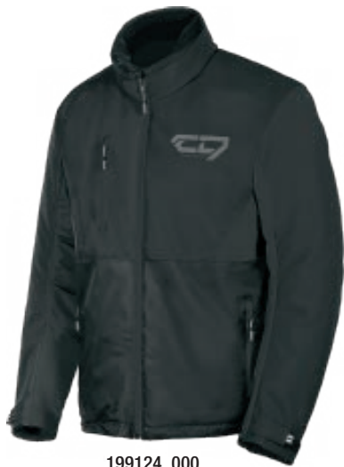
199124 000 Black - S to 7XL