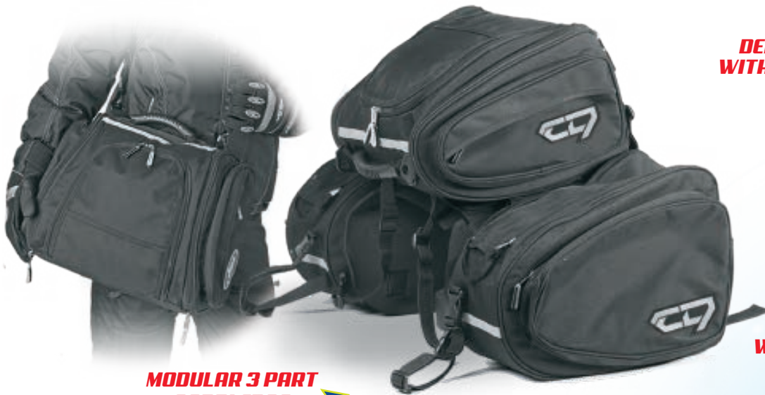
MODULAR 3 PART SADDLEBAG # 204508 00