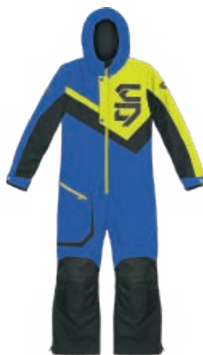
124724 200 Royal - 8 to 18