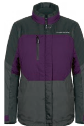
189124 3DK Plum - XS to 2XL