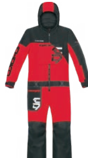
120723 100 Red - 6 to 18