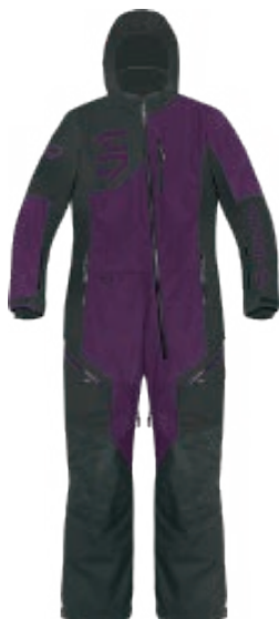
183724 3DK Plum - XS to 2XL