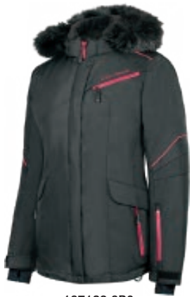
187123 8R0 Black Bengaline/Rose Red - XS to 2XL