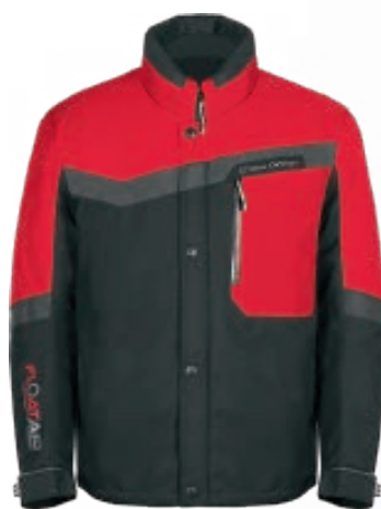
196124 100 Red - S to 2XL