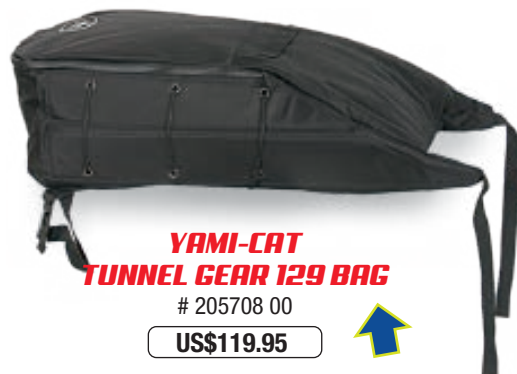
YAMI-CAT TUNNEL GEAR 129 BAG # 205708 00 US$119.95