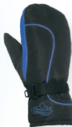
ROYAL # 20