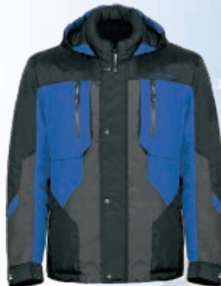
195123 200 Royal - S to 2XL