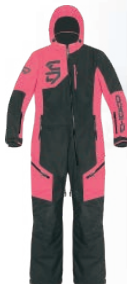
183724 8R0 Rose Red - XS to 2XL