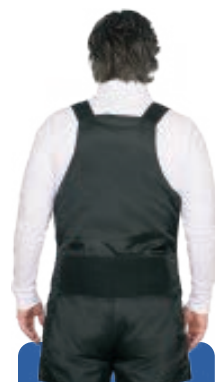
Power Pleated padded stretch back