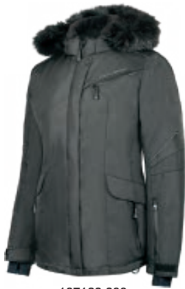
187123 900 Dark Grey/Bengaline - XS to 2XL