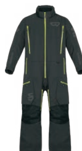
170724-OSF Black/Lime zippers - S to 2XL