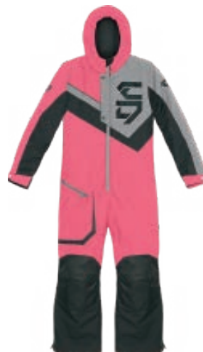
124724 8R0 Rose Red - 8 to 18