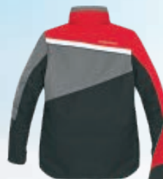
121824 100 Red - 8 to 18