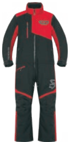
190724 100 Red - s to 2xl