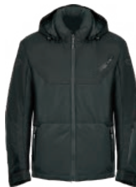
194123 000 Black - S to 3XL