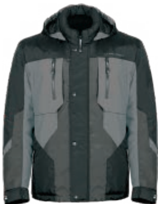
195123 900 Grey - S to 2XL