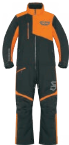
190724 ORG Orange - s to 2xl