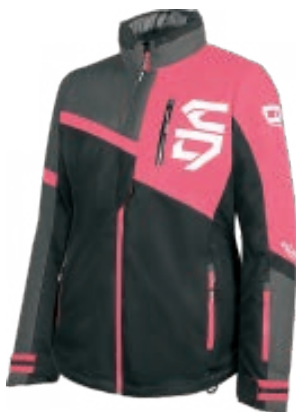
181123 8R0 Rose Red - XS to 2XL