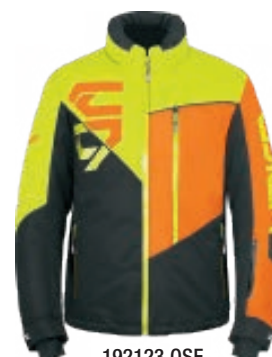
192123 0SF Orange/Safety Lime - S to 2XL