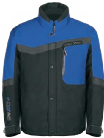
196124 200 Royal - S to 2XL