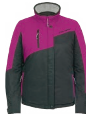
186124 BRY Berry - XS to 2XL