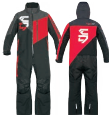
191724 100 Red - S to 2XL