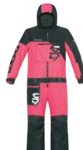
120723 8R0 Rose Red - 6 to 18