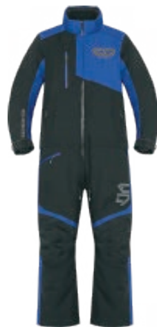
190724 200 Royal - s to 2xl