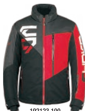
192123 100 Red - S to 2XL