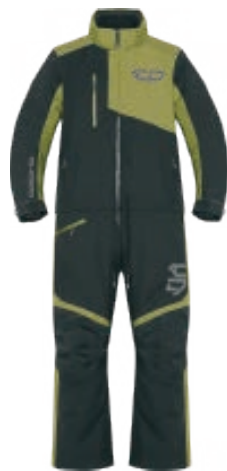
190724 OLV Olive - s to 2xl