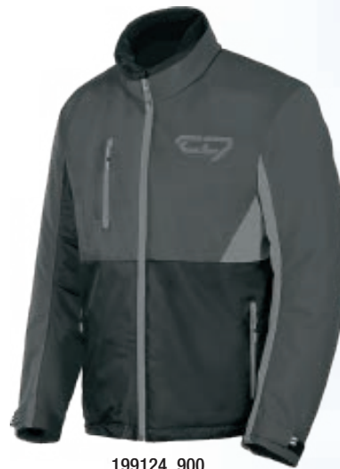
199124 900 Grey - S to 5XL