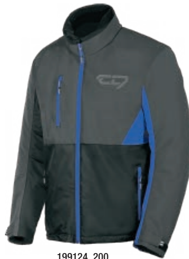
199124 200 Royal - S to 2XL