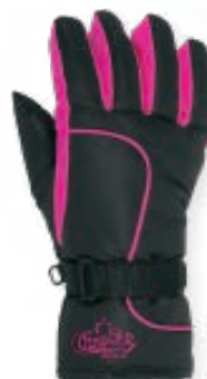
FUCHSIA # H8