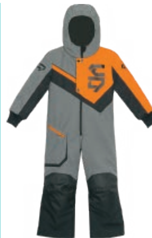
114724 90R Grey/Orange - 2 to 6X