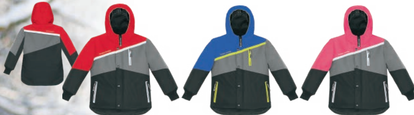
111824 100 Red - 2 to 6X