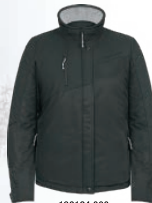
186124 000 Black - XS to 3XL