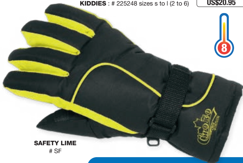
SAFETY LIME # SF