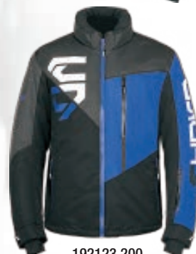
192123 200 Royal - S to 2XL