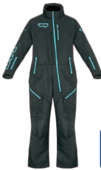
184724 005 Black/Lake Green zips - XS to 2XL