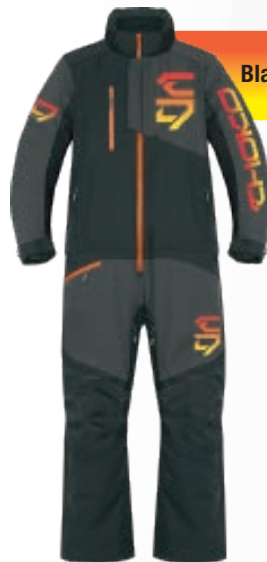
190724 09H Black/Grey/Flame print S to 3XL