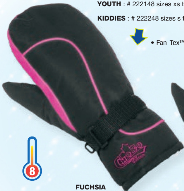
FUCHSIA # H8