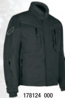
178124 000 Black - S to 3XL