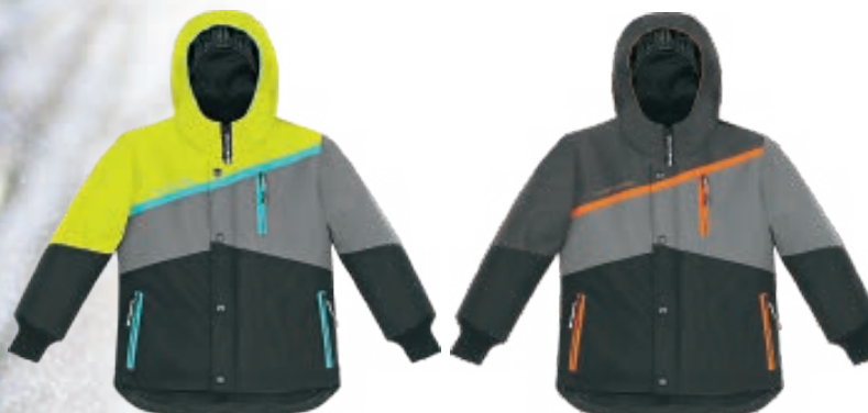
111824 SFT Safety Lime - 2 to 6X