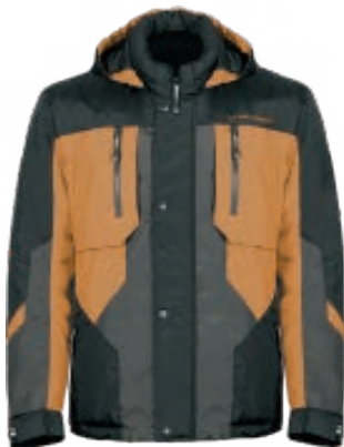
195123 BRN Bear Brown - S to 2XL