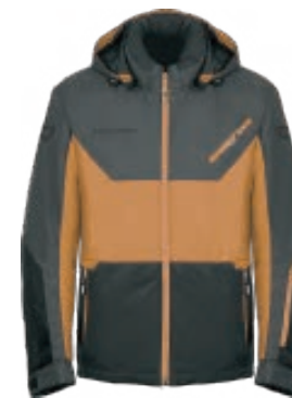
194123 BRN Bear Brown - S to 2XL