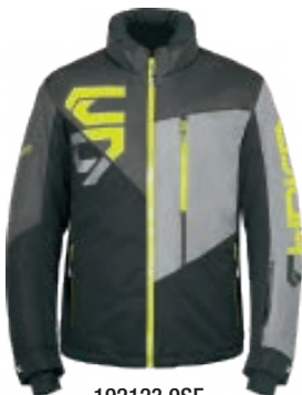
192123 9SF Grey/Safety Lime - S to 2XL