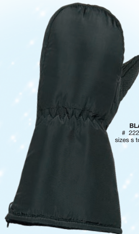
BLACK # 222201 00 sizes s to l (2 to 6)

YOUTH : # 225148 sizes xs to xl (8 to 16)