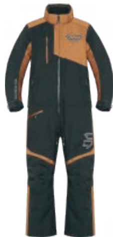
190724 BRN Bear Brown - s to 2xl