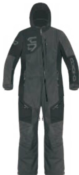
183724 900 Dark Grey - XS to 2XL