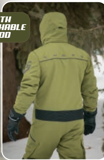
170724-OLV Olive - S to 2XL