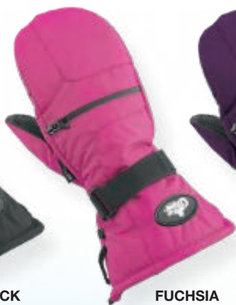
FUCHSIA # 222108 H8 xs to xl (8 to 16)