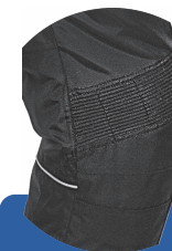
Triple padded articulated knee patches with power pleating