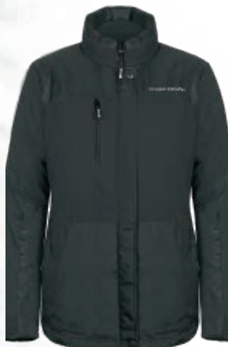
189124 000 Black - XS to 3XL