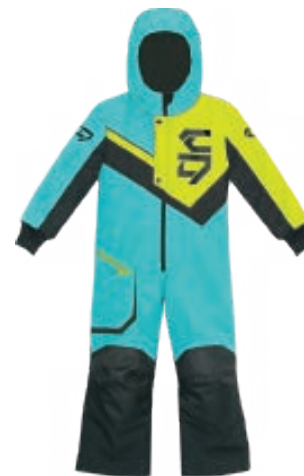
114724 5SF Lake Green/Safety Lime 2 to 6X