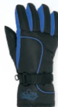
ROYAL # 20