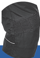
Triple padded articulated knee patches with power pleating