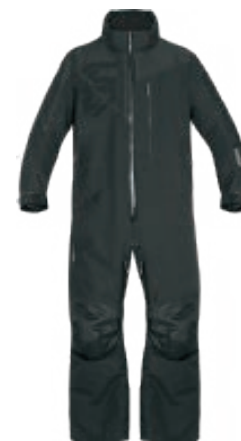
191724 000 Black - S to 3XL