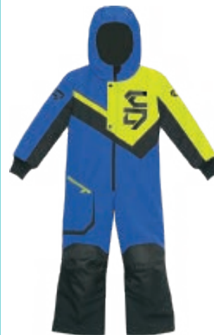
114724 200 Royal - 2 to 6X