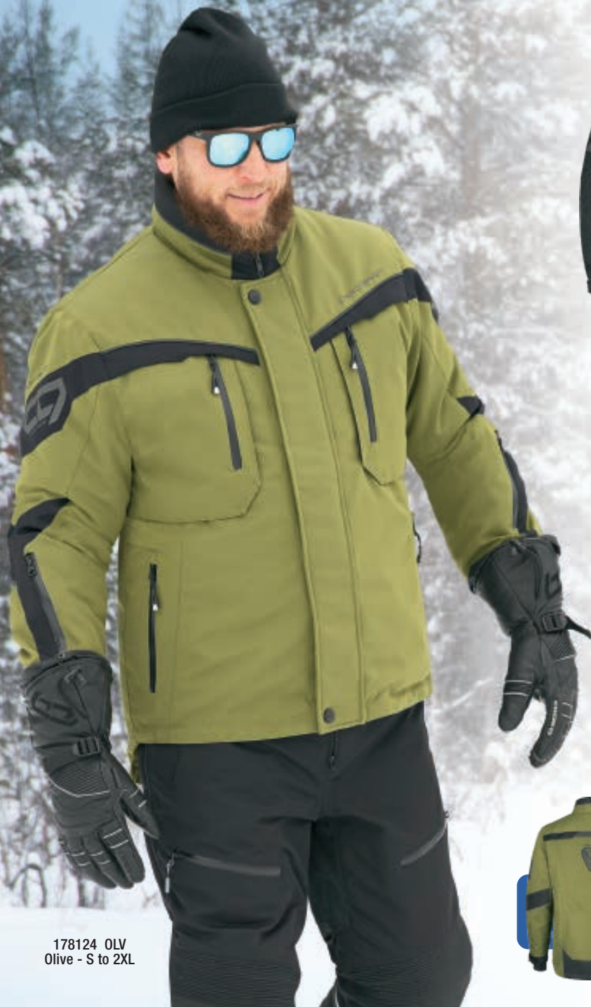
178124 OLV Olive - S to 2XL