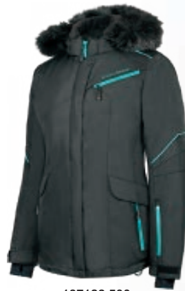
187123 500 Black Bengaline/Lake Green - XS to 2XL