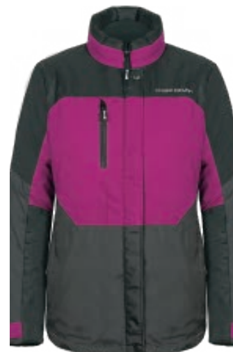
189124 BRY Berry - XS to 2XL