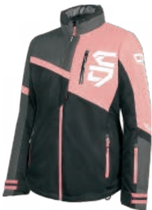
181123 COR Coral - XS to 2XL

REMOVABLE ZIP OUT LINER EASY ONE STEP SYSTEM INNOVATION BY CHOKO