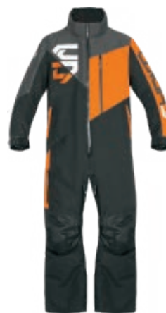
191724 ORG Orange - S to 2XL