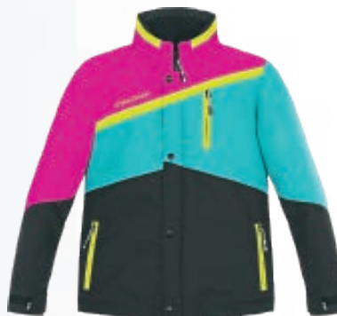
121824 H85 Fuchsia / Lake Green - 8 to 18