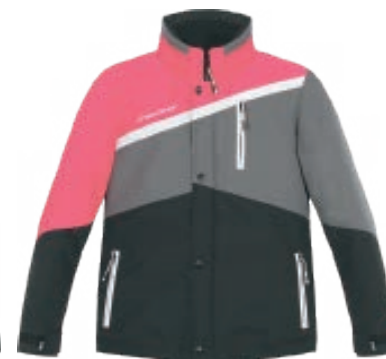
121824 8R0 Rose Red - 8 to 18