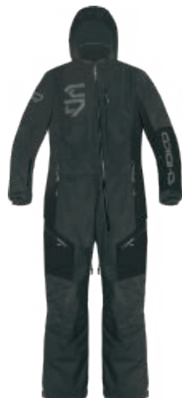
183724 000 Black - XS to 3XL