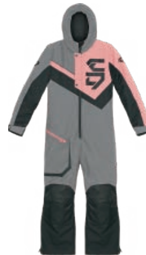
124724 9C0 Grey / Coral - 8 to 18