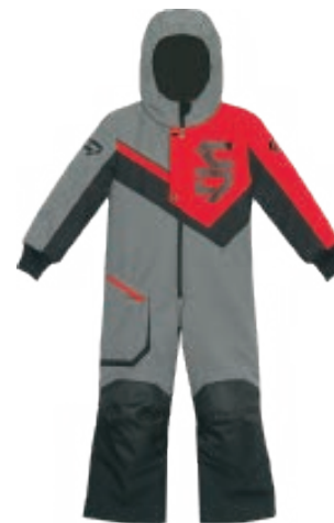
114724 100 Red - 2 to 6X