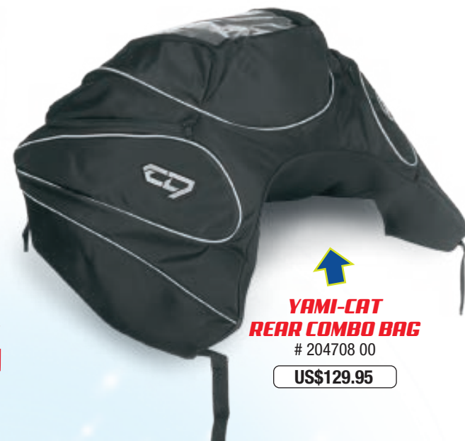
YAMI-CAT REAR COMBO BAG # 204708 00 US$129.95