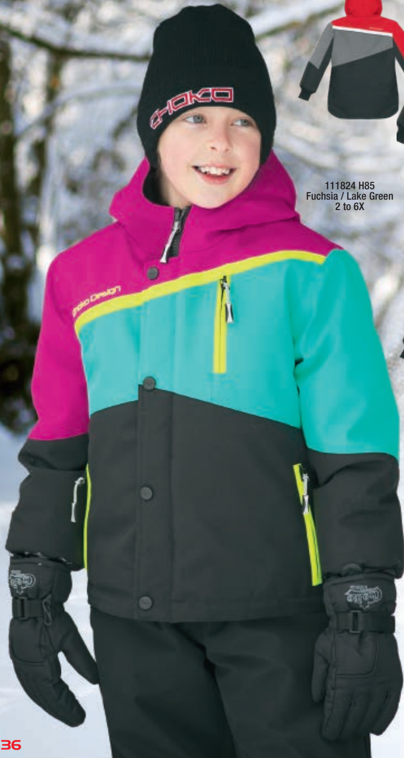
111824 H85 Fuchsia / Lake Green 2 to 6X