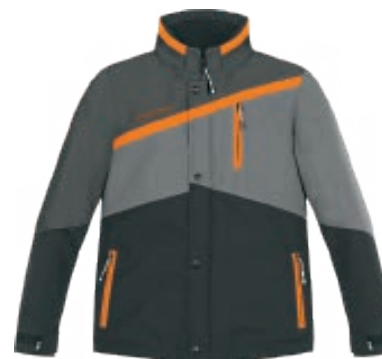
121824 900 Grey - 8 to 18