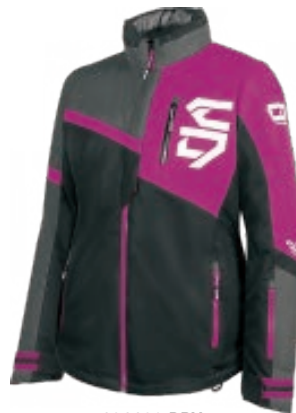
181123 BRY Berry - XS to 2XL