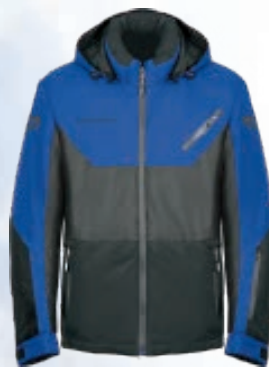
194123 200 Royal - S to 2XL