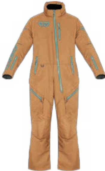
184724 BRN Bear Brown/Lake Green zips - XS to 2XL