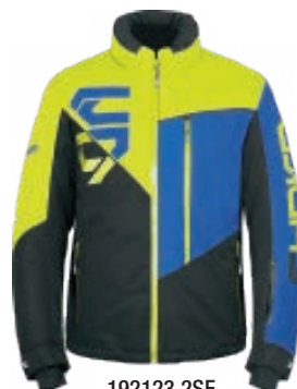
192123 2SF Royal/Safety Lime - S to 2XL