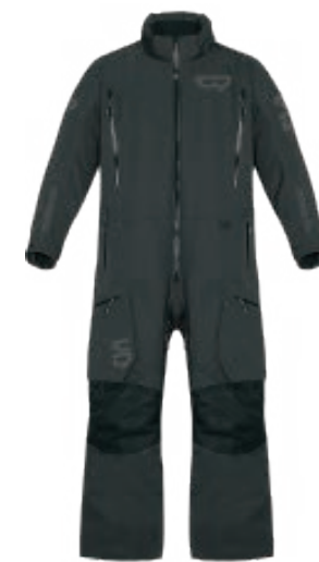
170724-000 Black - S to 3XL

Nylon Bengaline with Teflon protective finish technically coated for a softer touch.