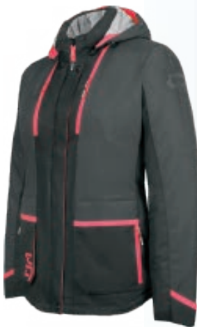
185123 9R8 Dark Grey/ Rose Red - XS to 2XL