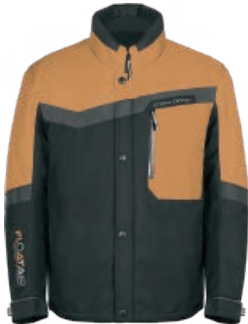
196124 BRN Bear Brown - S to 2XL