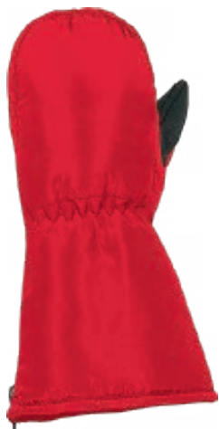
RED # 222201 10 sizes s to l (2 to 6)