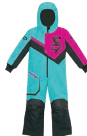
114724 5H8 Lake Green/Fuchsia - 2 to 6X