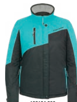
186124 500 Lake Green - XS to 2XL