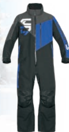
191724 200 Royal - S to 2XL