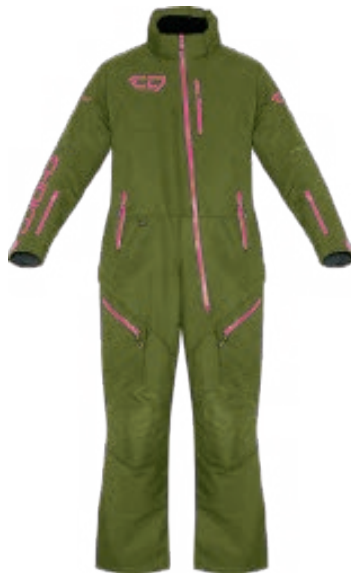
184724 OLV Olive/Fuchsia zips - XS to 2XL