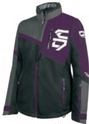
181123 3DK Plum - XS to 2XL