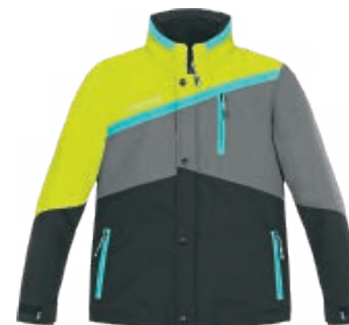
121824 SFT Safety Lime - 8 to 18