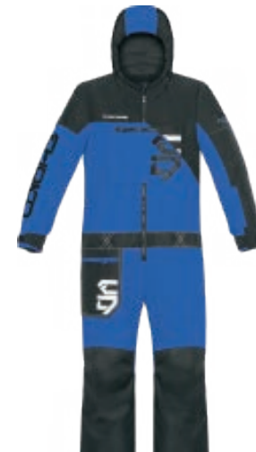
120723 200 Royal - 6 to 18