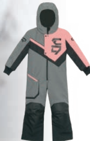
114724 9C0 Grey/Coral - 2 to 6X