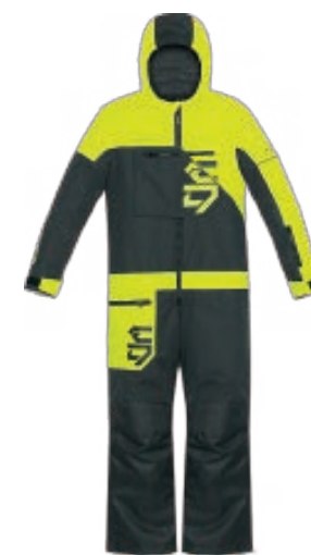
120723 9SF Safety Lime - 6 to 18