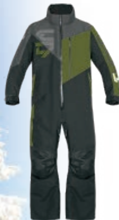
191724 OLV Olive - S to 2XL