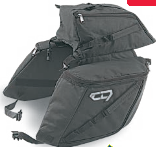
POLARIS AXYS SADDLEBAG # 204251 00 US$99.95