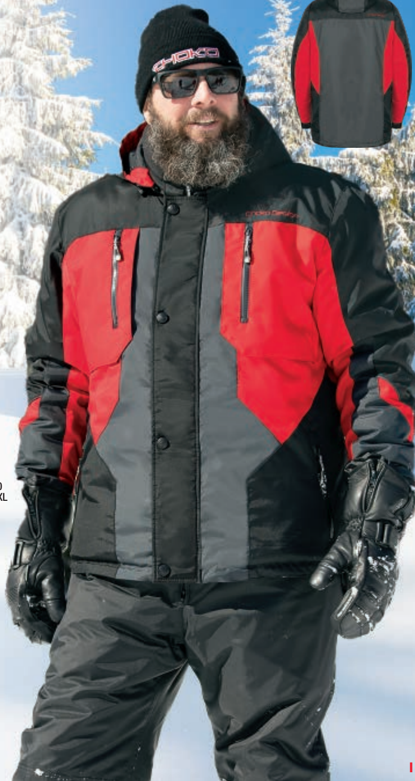
195123 100 Red - S to 2XL