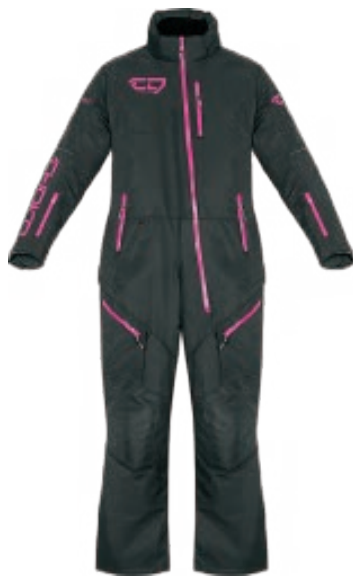
184724 0H8 Black/Fuchsia zips - XS to 2XL