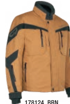
178124 BRN Bear Brown - S to 2XL