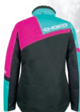
181123 5H8 Lake Green / Fuchsia - XS to 2XL