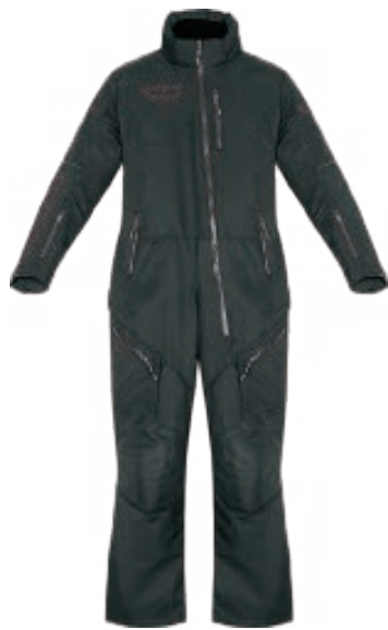
184724 000 Black - XS to 3XL