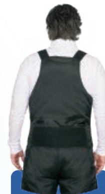
Power Pleated padded stretch back