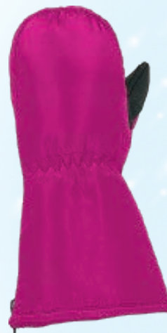
FUCHSIA # 222201 H8 sizes s to l (2 to 6)