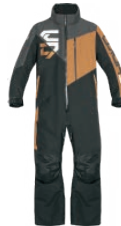
191724 BRN Bear Brown - S to 2XL