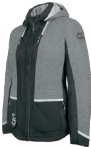
185123 AH9 Heather Grey - XS to 2XL