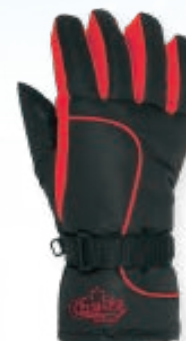
RED # 10