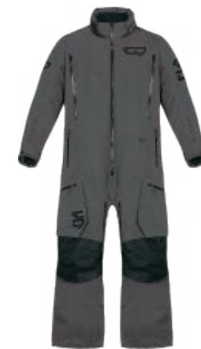
170724-900 Grey - S to 2XL

TECHNICALLY DESIGNED WITH 4 POINTS VENTILATION SYSTEM • POWER PLEATED BACK STRETCH PANEL FOR EASY MOVEMENT