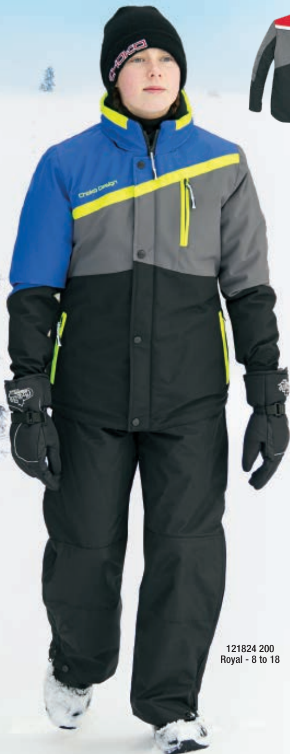
121824 200 Royal - 8 to 18