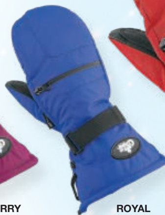
ROYAL # 222108 20 xs to xl (8 to 16)

YOUTH : # 222148 sizes xs to xl (8 to 16)