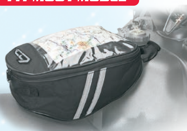
TANK BAG/ MAP POUCH # 203008 00 US$49.95