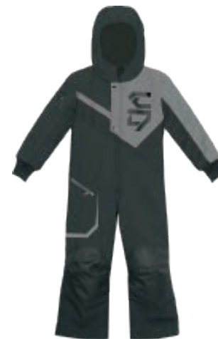
114724 009 Black/Grey - 2 to 6X