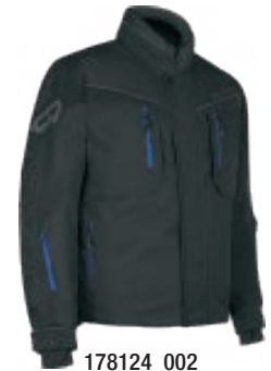
178124 002 Black / Royal zippers - S to 2XL