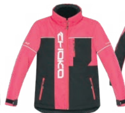
123123 8R0 Rose Red - 6 to 18