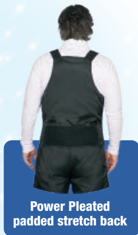
Power Pleated padded stretch back