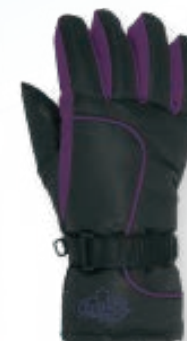
PLUM # 3D