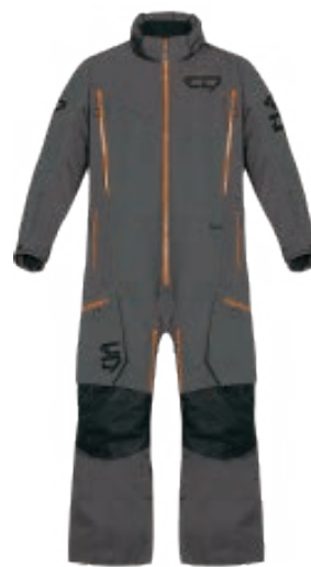
170724-90R Grey/Orange zips - S to 2XL