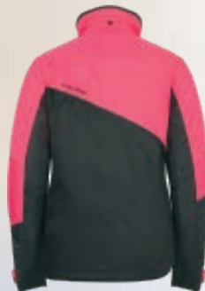
186124 8R0 Rose Red - XS to 2XL