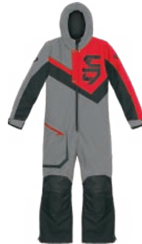
124724 100 Red - 8 to 18