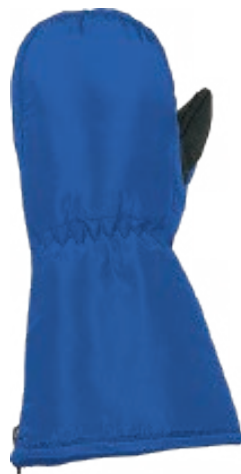
ROYAL # 222201 20 sizes s to l (2 to 6)