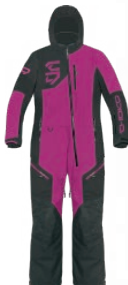
183724 BRY Berry - XS to 2XL