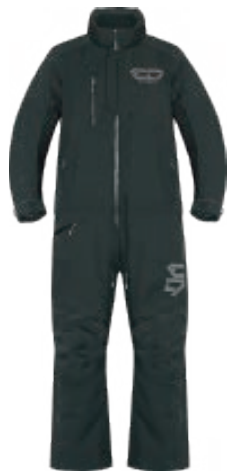
190724 000 Black - s to 3xl