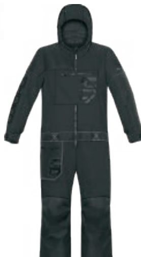
120723 000 Black - 6 to 18