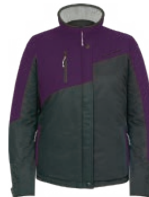
186124 3DK Plum - XS to 2XL