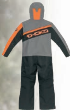
124724 90R Grey / Orange - 8 to 18