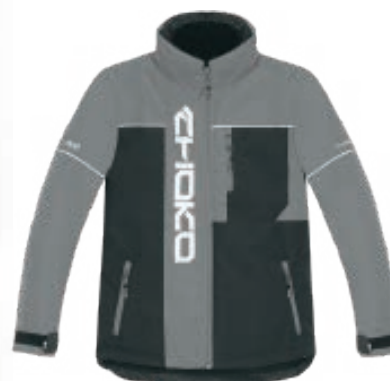
123123 900 Grey - 6 to 18