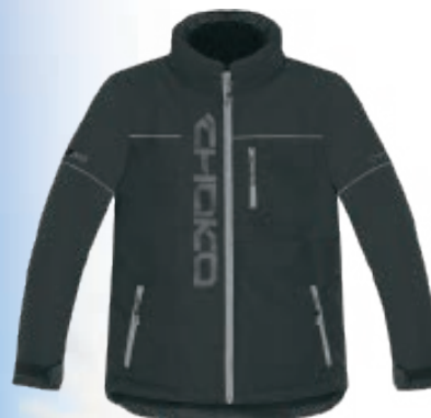
123123 000 Black - 6 to 18