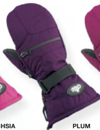
PLUM # 222108 3D xs to xl (8 to 16)