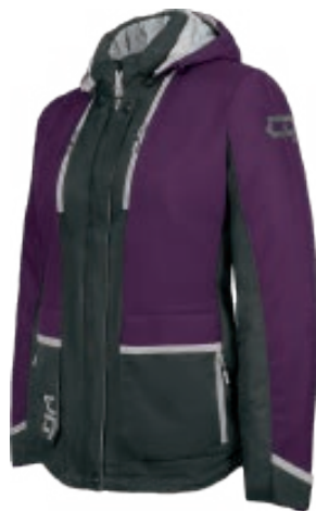
185123 3DK Plum - XS to 3XL