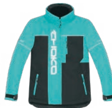
123123 500 Lake Green - 6 to 18