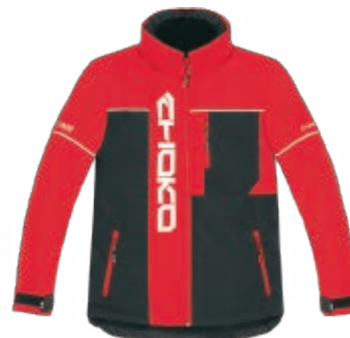
123123 100 Red - 6 to 18