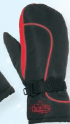
RED # 10