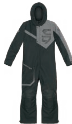
124724 009 Black / Grey - 8 to 18