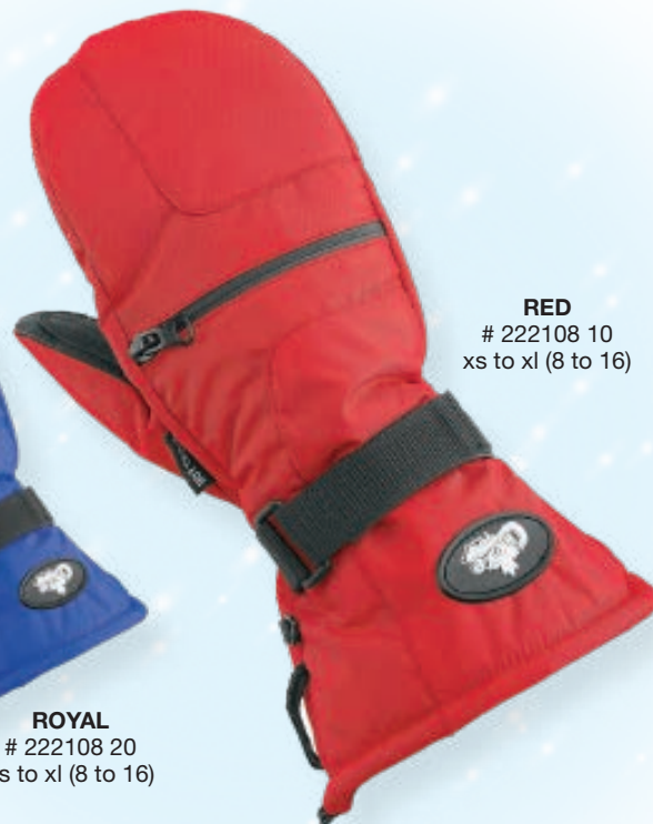
RED # 222108 10 xs to xl (8 to 16)