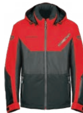
194123 100 Red - S to 2XL