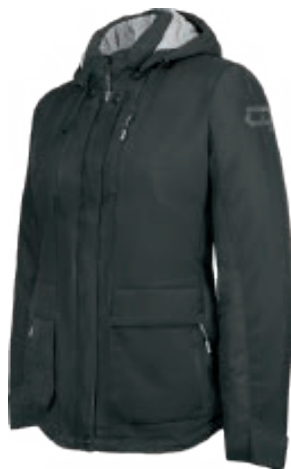
185123 000 Black - XS to 3XL