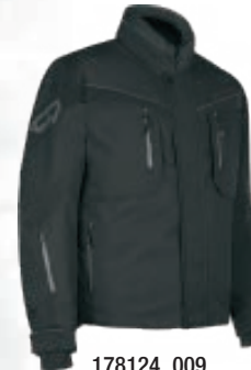
178124 009 Black / Grey zippers - S to 2XL