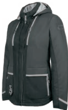
185123 900 Grey - XS to 3XL