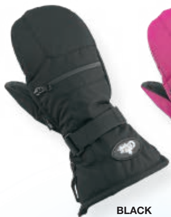
BLACK # 222108 00 xs to xl (8 to 16)