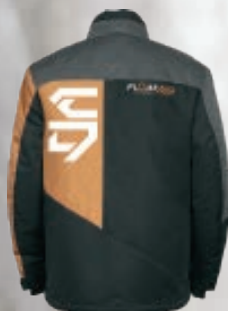
192123 BRN Bear Brown - S to 2XL