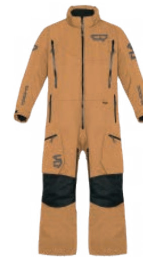
170724-BRN Bear Brown - S to 2XL