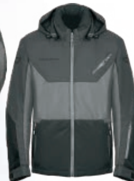
194123 900 Grey - S to 2XL

194123 09H Black/Grey/Flame print S to 3XL