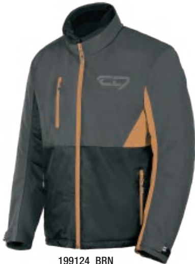
199124 BRN Bear Brown - S to 2XL