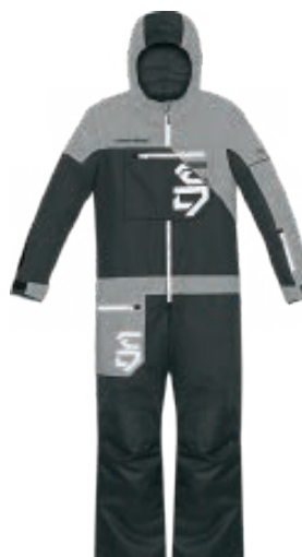
120723 AH9 Heather Grey - 6 to 18