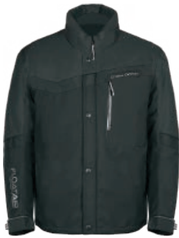
196124 000 Black - S to 7XL