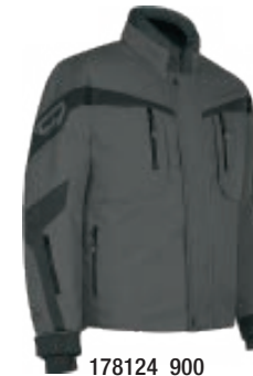
178124 900 Dark Grey - S to 3XL