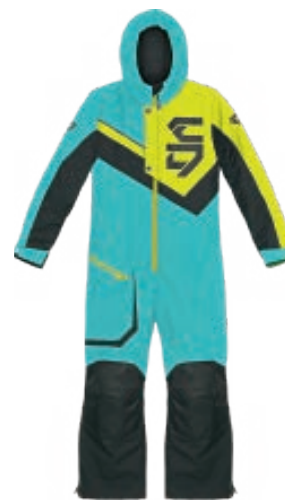
124724 5SF Lake Green Safety Lime - 8 to 18