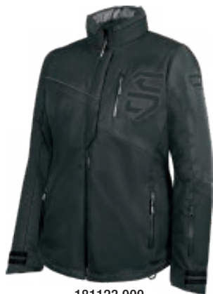
181123 000 Black - XS to 3XL