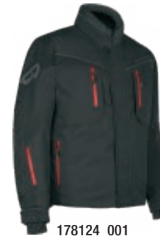
178124 001 Black / Red zippers - S to 2XL