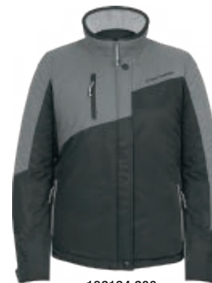
186124 900 Grey - XS to 2XL