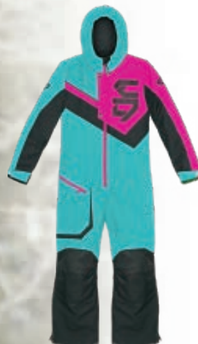
124724 5H8 Lake Green Fuchsia - 8 to 18